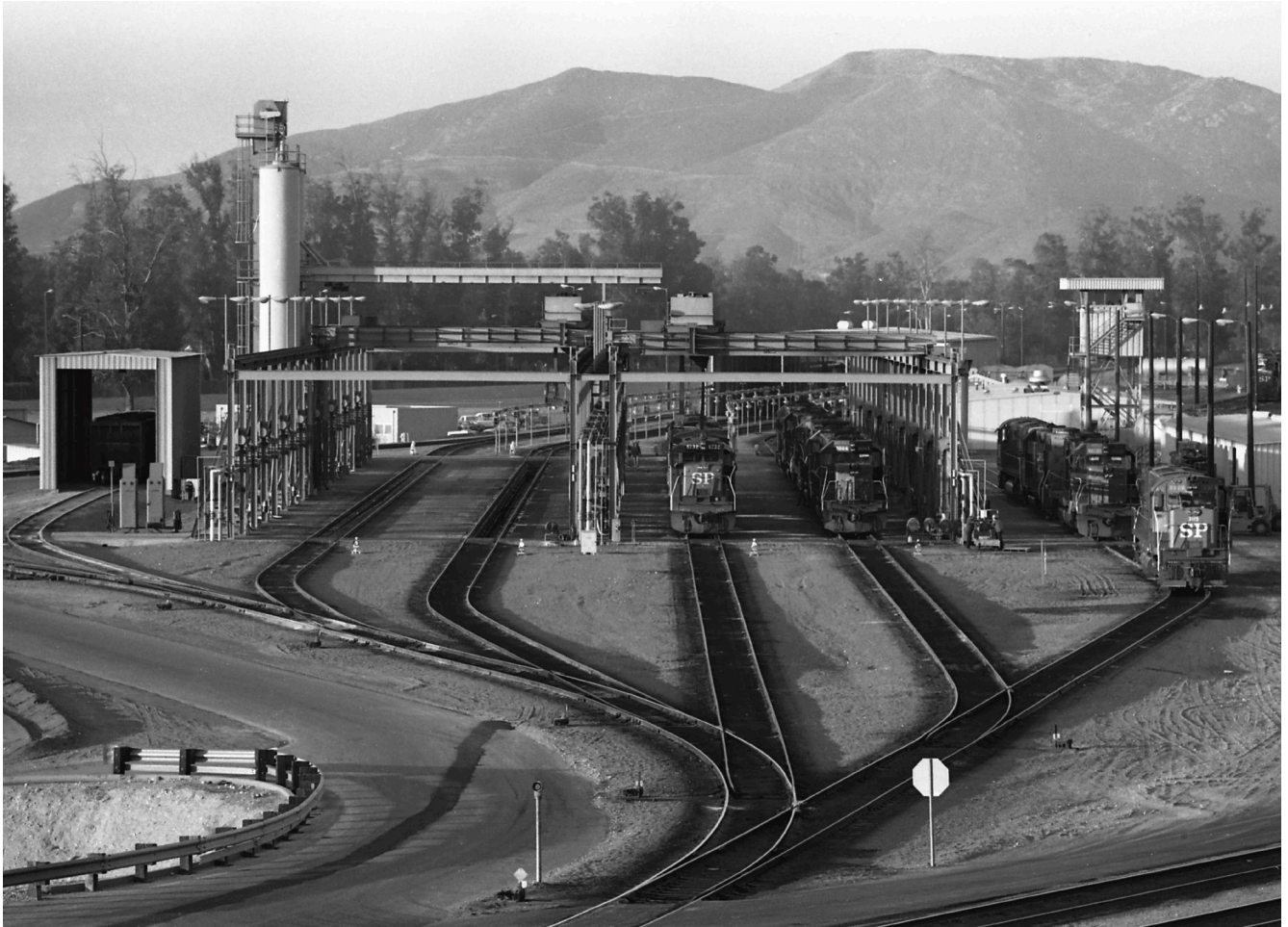
The West Colton engine facility back when power from three builders still populated the service tracks.