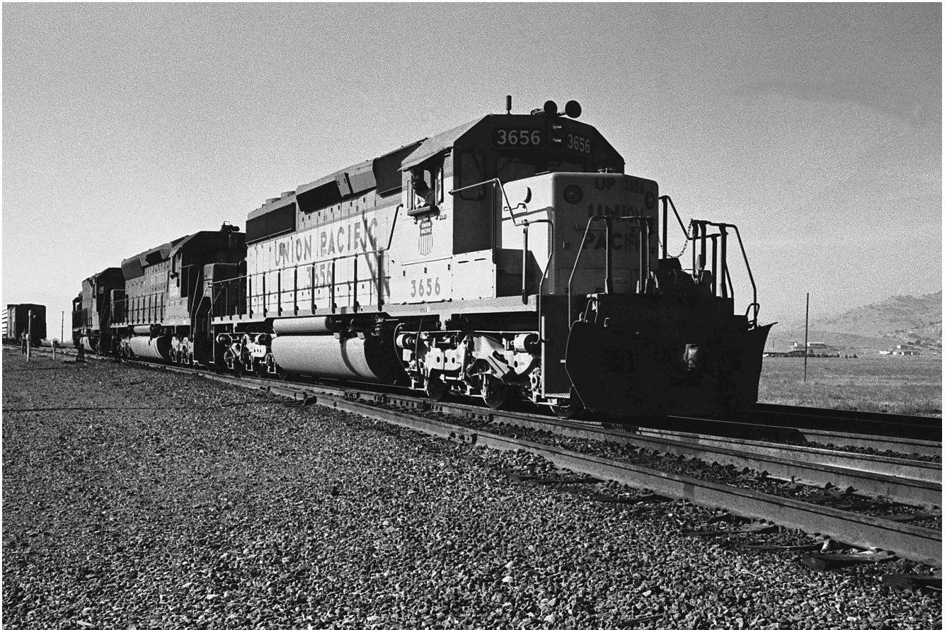
A four unit helper extricates itself from eastbound tonnage at Summit Switch east of Tehachapi, 1980.