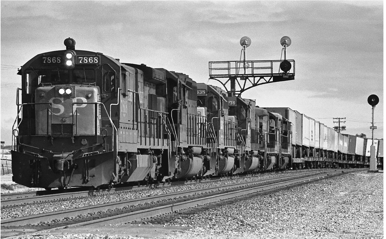
A B30-7 drops into the top of San Timoteo Canyon with westbound trailers, 1981.