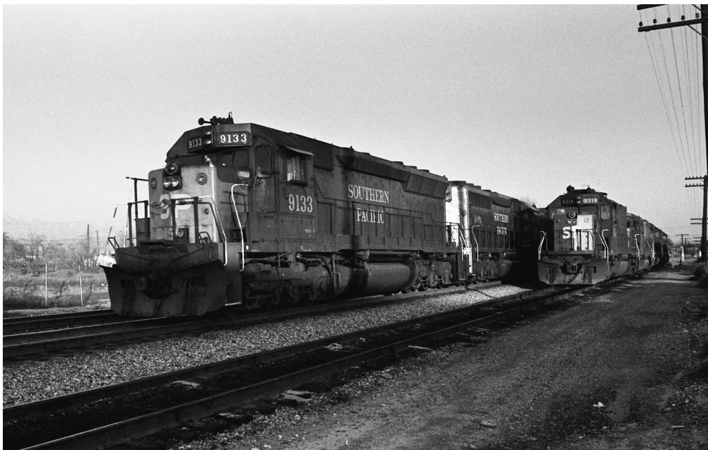
An SD40 with a pair of SD45s sit in the small yard at Colfax.