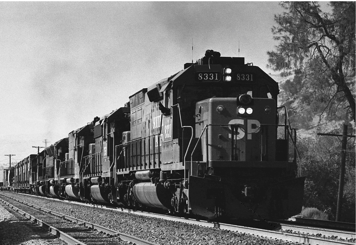
The engineer's feet cooling in the mountain air, an eastbound climbs Tehachapi at Woodford, 1981.